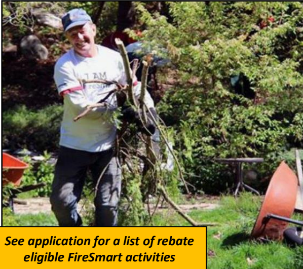
See application for a list of rebate eligible FireSmart activities

What? - Rosland’s ‘FireSmart Rebate Program’ is offering some property owners a rebate of up to $1,000 for qualified FireSmart hazard reduction work performed on their homes and yards. Homeowners will be reimbursed for 50% of material and labor costs with a maximum $1,000 rebate per property on a $2,000 or more expenditure.