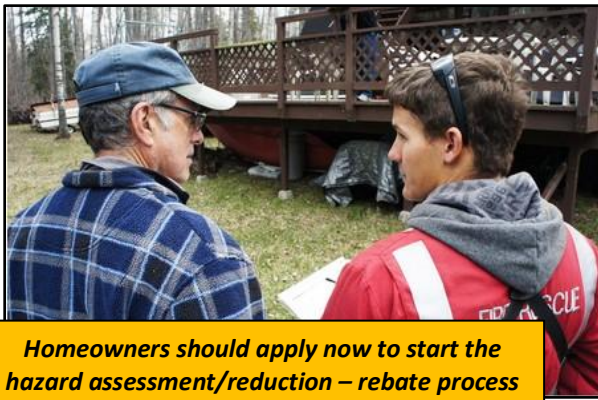
Homeowners should apply now to start the hazard assessment/reduction – rebate process

How? - Homeowners eligible to participate in the FireSmart Rebate Program can apply for a free FireSmart hazard assessment on their home and yard. Following the assessment, homeowners will work with the FireSmart assessor / advisor to identify priority hazard items and then perform the required hazard reduction work. Material costs and labor (reimbursed at $28.54 per hour) are tracked and receipts submitted to the FireSmart advisor during the follow-up assessment visit.