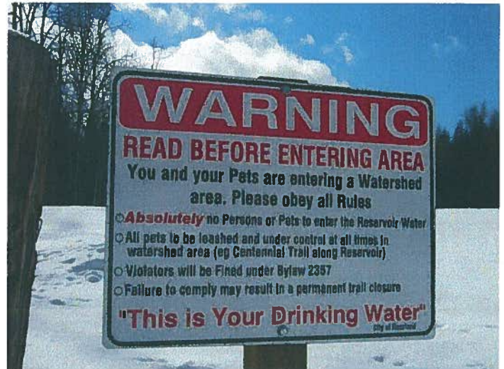
Watershed Trails Sign

During the Spring Freshet, all three creeks, and the reservoir, overflow water for many months as supply exceeds consumption.