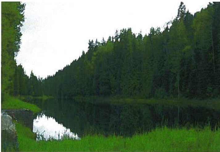
Star Gulch Reservoir in Summer

The Kirkup zone is supplied from a small pump station at the intersection of Kirkup Ave and Plewman Way which is in the Upper Rossland Zone. Water is pumped to a bolted steel reservoir located on Mount Kirkup and feeds residential properties that are located above the minimum pressure zone provided by gravity from the treatment plant.