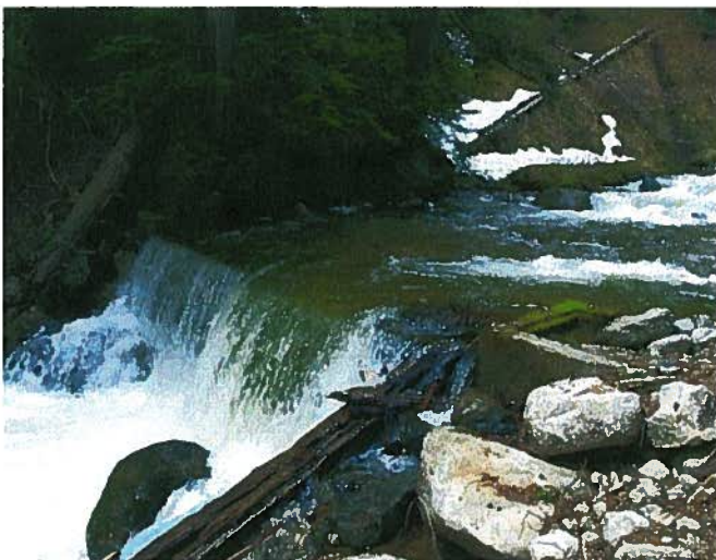
Hanna Creek Raw Water Intake

The City's raw water source is entirely surface water in three alpine creek catchments: Topping Creek, Hanna Creek and Murphy Creek, with intakes adjacent to Highway 3B between Red Mountain and Nancy Greene Summit, ranging in elevation from 1200m to 1550m above sea level. A map of the intake locations is provided in Appendix A.